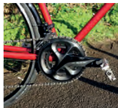
Top: The Reynolds 725 frame has a lovely, lustrous paint finish. Black is also an option Bottom: It comes with a 50-34 double and an 11-32 cassette but you can specify lower gears when ordering

briefest of squeaks from the front in the wet. The other advantage – particularly for those using the Synapse throughout winter or for year-round commuting – is longer rim life.