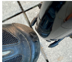
Top: Both bikes have 11-speed Shimano 105, which I'd choose over the new 12-speed (see p4) Bottom: Nice to have toe clearance on a medium-sized road bike

you can see a lightweight steel fork's tips moving over rough chipseal.