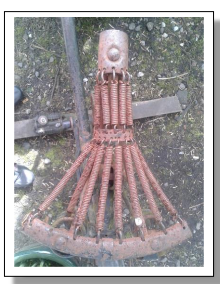
How brave are you? Would you sit on this saddle?