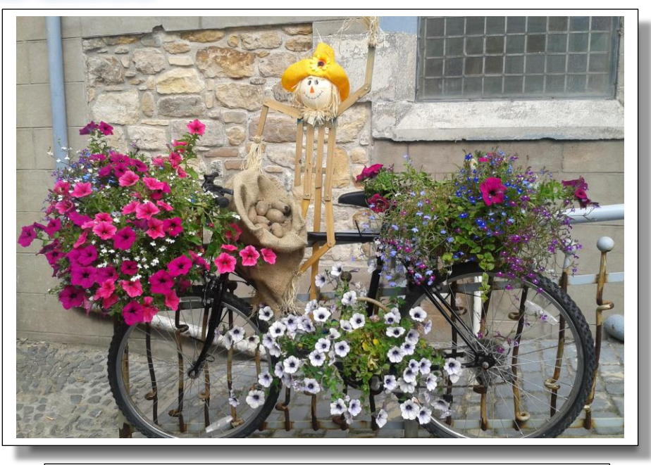
One of 70+ similarly decorated bikes at Pitnweem Arts Festival