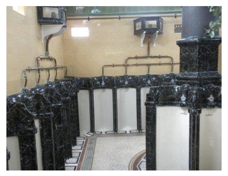
A 'first' for Fife Wheels... a public toilet! (20p for your thoughts!)

A good time was had by all and, with really only two iffy days, we never actually pedalled with water proofs on.