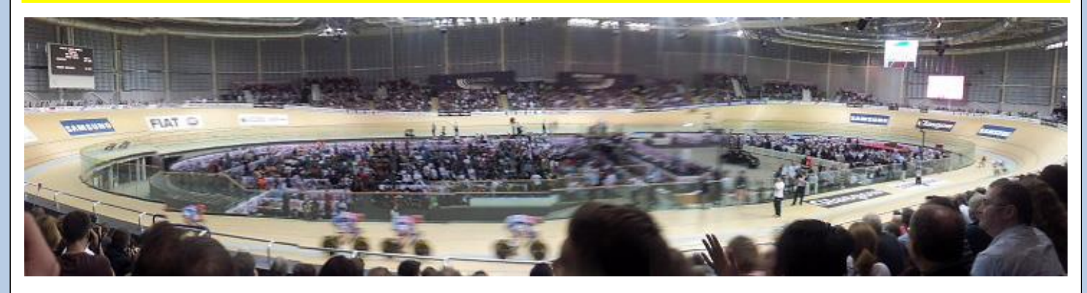
The Sir Chris Hoy Velodrome

Next year's National CTC AGM will take place on Saturday 10th May in Glasgow, taking advantage of the city being host for the 2014 Commonwealth Games. The venue is the Radisson Blu Hotel on Argyll Street, just behind Central Station.