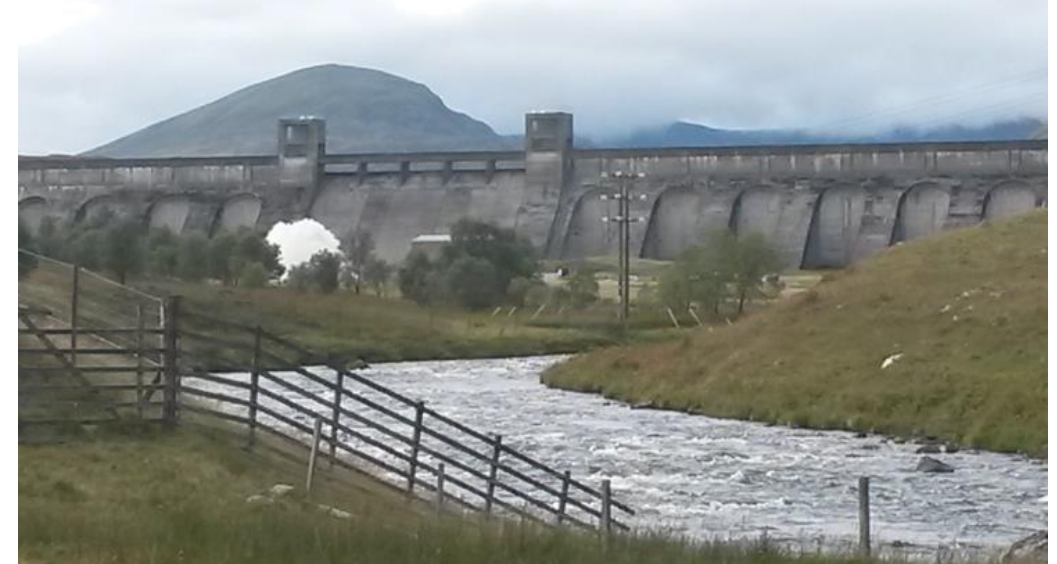
The Lubreoch Dam at the end of Loch Lyon

It was a lovely wee road with, unsurprisingly, no traffic. The climb up was steep and the drop down the other side made more difficult by the poor surface.