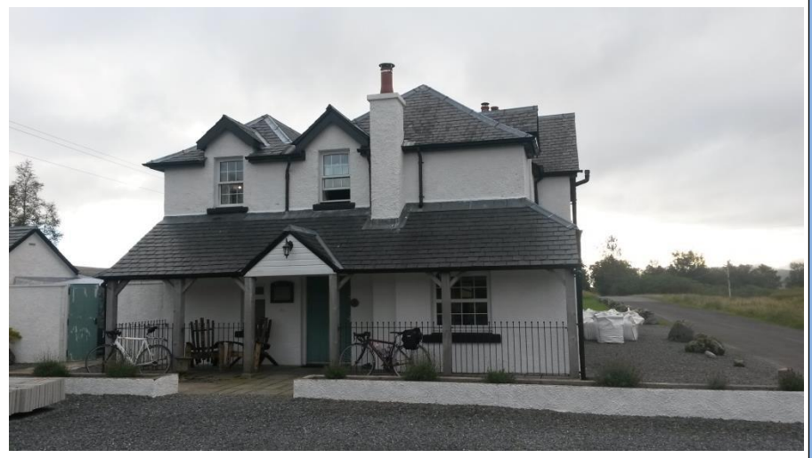
The Moor of Rannoch Hotel, Rannoch Station

The food was also excellent. Superb in fact, so much so I had a sweet because I didn't want to stop eating, and I never have a sweet normally. And later in the evening, after long chats with everyone, a complementary cheese board appeared and I felt I'd definitely, must have definitely, walked off the train earlier and straight into a little corner of heaven.