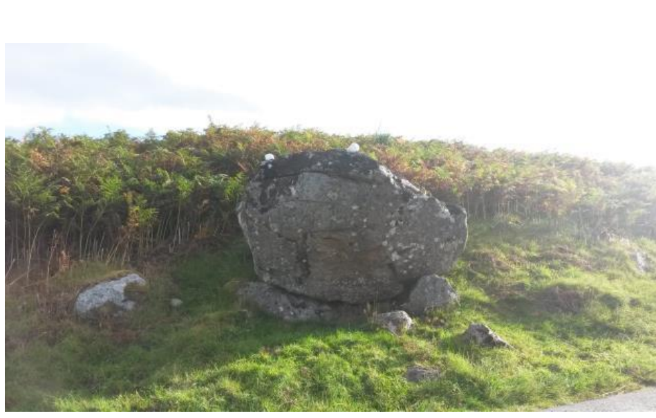
The infamous 'Frog' of Rannoch Moor

After a breakfast consisting of the best, and biggest, mushroom omelette I'd ever attempted to eat, as well as all the usual 'help yourself' goodies we set off on the only road out of Rannoch Station with very little plan in our heads as to how we would eventually end up home that evening.