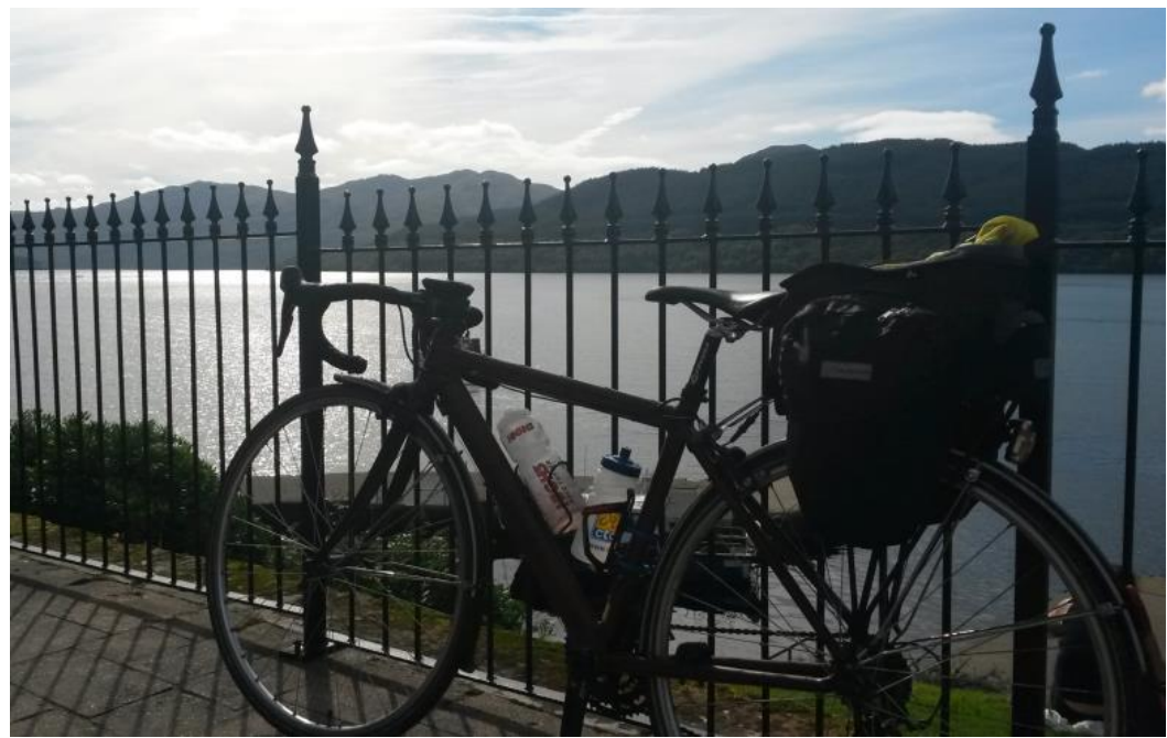
Waiting for the ferry at Inversnaid

After a leisurely late breakfast in the Katrine Café, and a quick catch-up with friends from Glasgow I hadn't seen in years, we set off now knowing for sure we'd never catch the 12:30 ferry from Inversnaid to Tarbet. This didn't really matter as it now meant we were able to enjoy the ride around Loch Katrine to Stronachlachar without any pressure.