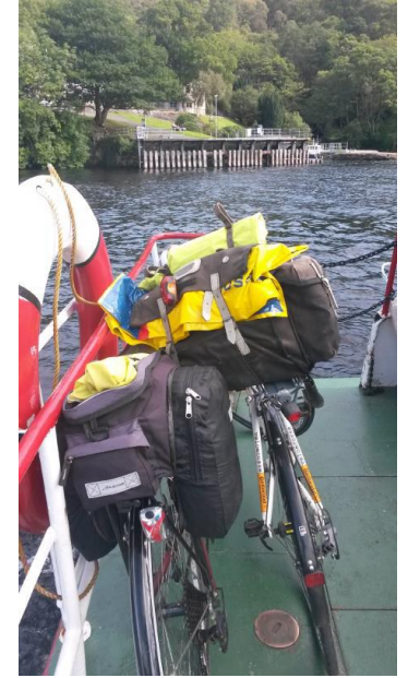
On the Inversnaid-Tarbert ferry

The tiny ferry tutted across the unusually still waters of Loch Lomond, past Lover's Island, so called because newlyweds were left there overnight and if they were still talking to one another in the morning, then their marriage would last. A pair of cormorants, high on treetops were silhouetted against a wispy sky, suitably spaced apart as though they hadn't quite managed the lovers' test. We looked at our watches and wondered if 'as long as possible' was really a good idea as Bridge of Orchy was a long way still to go, and we had dinner reservations for 7:30pm!