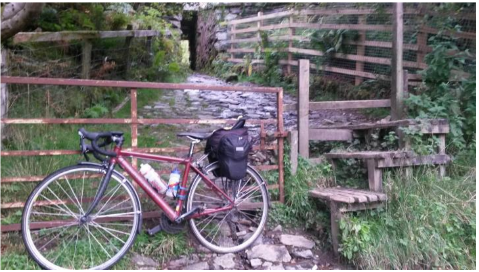
On The West Highland Way, through the vennel

But we eventually plunged in at Tyndrum, which was only 7 miles from our final destination. We had time, it was Landrover track all the way ('trust me') and it was what Gregor really wanted to do.