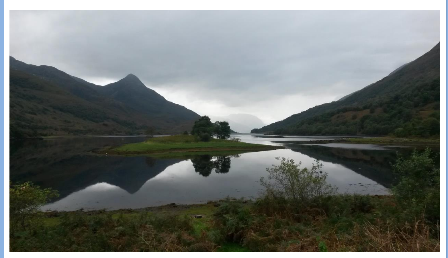
On the detour after Loch Leven

It was lovely to escape the traffic for a short while, even though it was 16 miles where 4 would have taken us direct to North Ballachulish. But remember, we weren't doing this to win any time prizes.