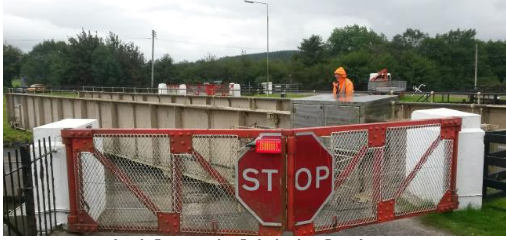
Lock Gate on the Caledonian Canal

Heading for Rannoch, we had decided that Spean Bridge would be our end point for the day as going any further would provide little shelter while we waited for the only train that would get us there. Taking our time heading up the west side of the river and canal was far preferable to staying on the A82 any longer, especially as we were in no rush now, having made excellent time with a fairly good tail wind since Onich.