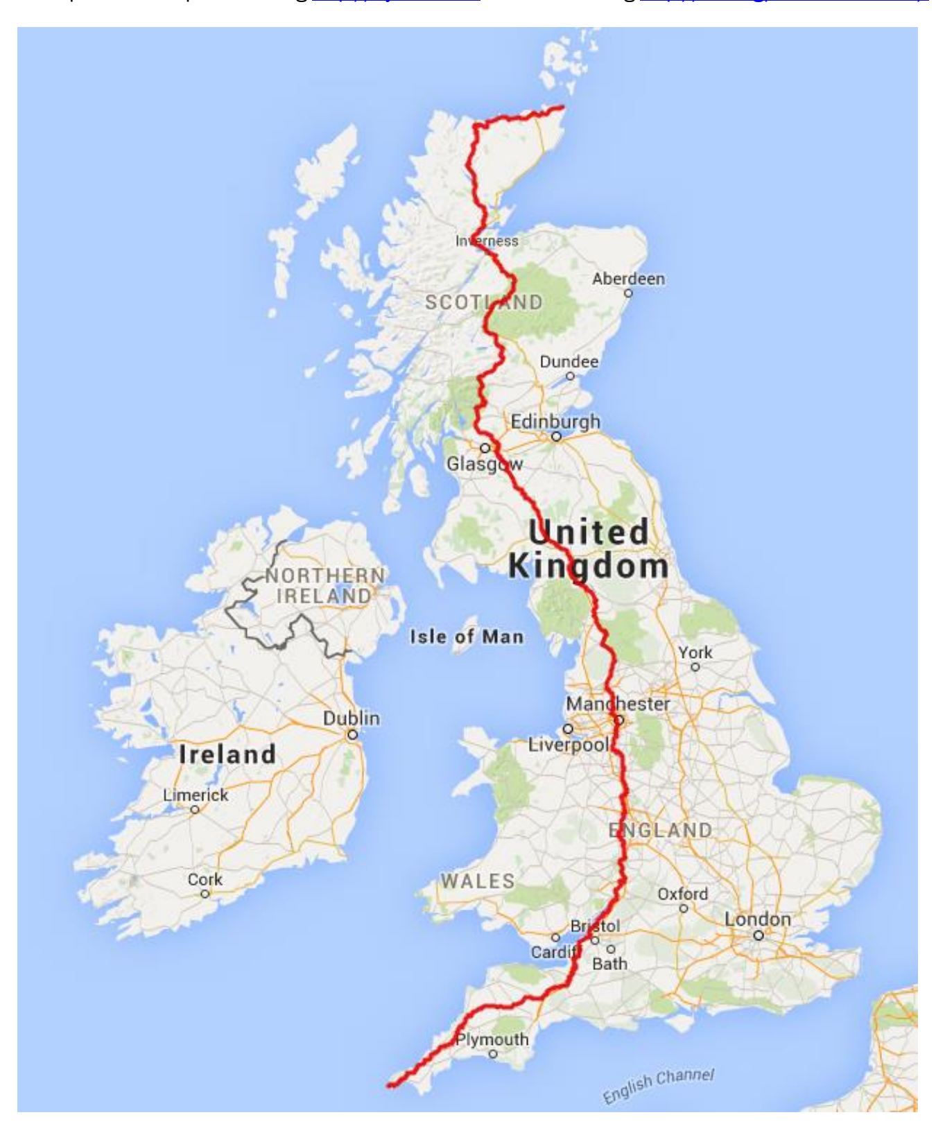
Example route as plotted using <a href="http://cycle.travel">http://cycle.travel</a> visualised using <a href="http://www.gpsvisualizer.com/">http://cycle.travel</a> visualised using <a href="http://www.gpsvisualizer.com/">http://www.gpsvisualizer.com/</a>

On the next few pages you will find a newly plotted route for completing the End to End via the fastest route available which will consist of main road usage though this was plotted using cycle.travel so therefore should be reasonably cycle friendly. Please note that this route has not been tested. This is a turn by turn route which runs over approximately 30 pages and is highly detailed.