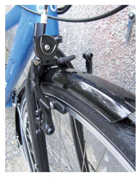
(Above) A Travel Agent enables the Orbit's right-hand Sora STI lever to operate a front V-brake. The rear V-brake is a drag brake operated by a bar-end friction lever, while the left-hand Sora lever works an Avid BB7 rear disc.

Direct lateral designs differ on details such as the precise positioning of the rear lateral tube. The Orbit closely approximates to a classic example, its only obvious departure from a strict interpretation being the alignment of the rear top tube, which joins the seat tube below the seat stays. The bottom tube, also known as the 'link' or 'boom' tube, connects the two bottom bracket shells and must be super-stiff for transmission efficiency. Orbit's design