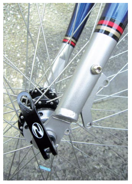
(Above) The Dawes fork and hub are disc-brake ready. That means a little extra weight if you're happy with the front cantilever. The fork has less offset than the Orbit's. Trail figures are similar since the Dawes uses a steeper head angle, but the Orbit's handling is more assured.

Both tandems combine a neatly TIG-welded aluminium frame, built using greatlyoversized tubes, with a TIG-welded unicrown steel fork. It's a well-chosen combination for tandem use, where the fork needs to be exceptionally strong yet resilient and the frame torsionally stiff. Both use a version of the direct lateral tandem frame layout, which is widely considered the best way to build a road tandem. The long central tube, split at the front seat tube and running from the head tube to a point close to the rear bottom bracket shell, adds lengthways torsional stiffness and constructs a triangle within the main frame for vertical strength, both with the minimum of material.