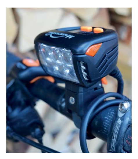
Above: The quick-release bracket is secure but sits the lamp quite high, so it could be vulnerable in a fall

The big benefit off-road is the spread of