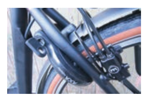
Above: Magura hydraulic rim brakes were once popular in MTB circles for their rim-crushing power

What to do with the goods bought there was problematic. While sturdy, the racks have top rails 16.4mm in diameter, which is too large for most pannier hooks. (Ortlieb make optional 20mm hooks.) The rear rack's lower rail is only 12.5mm so that should work, or you might use straps. The front rack, which comes with side panels, is angled upwards, perhaps in the hope