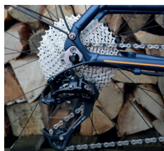
Above: The 11-40t cassette and 30t chainring give a 20in bottom gear – much lower than that of most road bikes

The Janis (after Joplin – you can work out the others) is the flat-bar road bike in the range. It's distinguished by its step-through, mixte-style frame, which makes it easy to get on and off. Most step-throughs – bespoke ones and Moultons aside – are heavy. The Janis is a mere 9.19kg. As with children's bikes, low weight makes a bigger difference the less strength the rider has.